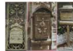
鍛造信箱 Forged mailbox