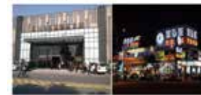
大中華國際美食館 Great China International Food Hall 金宏聖汽車精品百貨 Kim Hong-Sheng Automotive Department Store