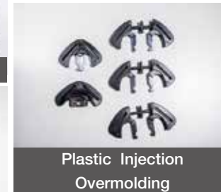
Plastic Injection Overmolding